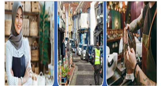
Bristol City Centre and High Streets Vacant Commercial Property Grant