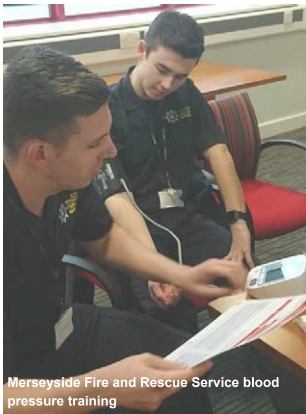
Merseyside Fire and Rescue Service blood pressure training

DsPH and teams across Cheshire and Merseyside collaborate on public health priorities that are best tackled at scale, using evidence-based solutions. A range of successful programs resulting in improved health outcomes have been delivered. These include reducing rates of cardiovascular disease (CVD), suicide prevention and tackling antimicrobial resistance (AMR). This approach has informed the work of Cheshire and Merseyside Health Care Partnership to promote a strong emphasis on prevention and population health. The partnership board has recently agreed to develop the partnership as a Marmot community and develop work with partners aligned to Marmot principles.