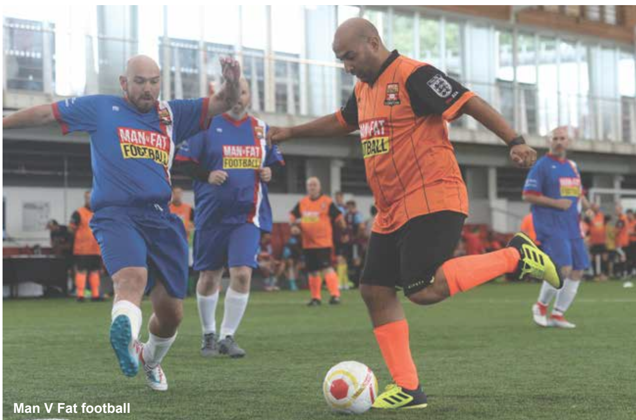
Man V Fat football

“As part of the local authority, public health is well placed to identify and tackle the social causes of health inequalities. Our integrated health and wellbeing service shows what can be achieved to support people with the greatest health needs. We have learned from this model and will be using the Public Health Quality Framework 33 to assess our services against values and health priorities.”