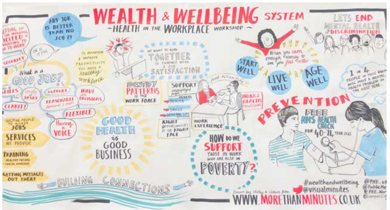
Wealth and wellbeing workshop: Visual minutes