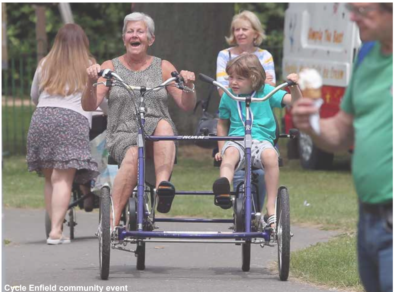
Cycle Enfield community event