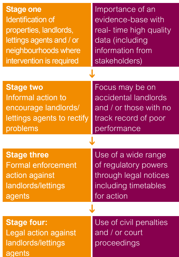
Diagram Three: Framework for enforcement

Drawing on our case studies and our policy and research review, one overall approach is highlighted in the diagram below.