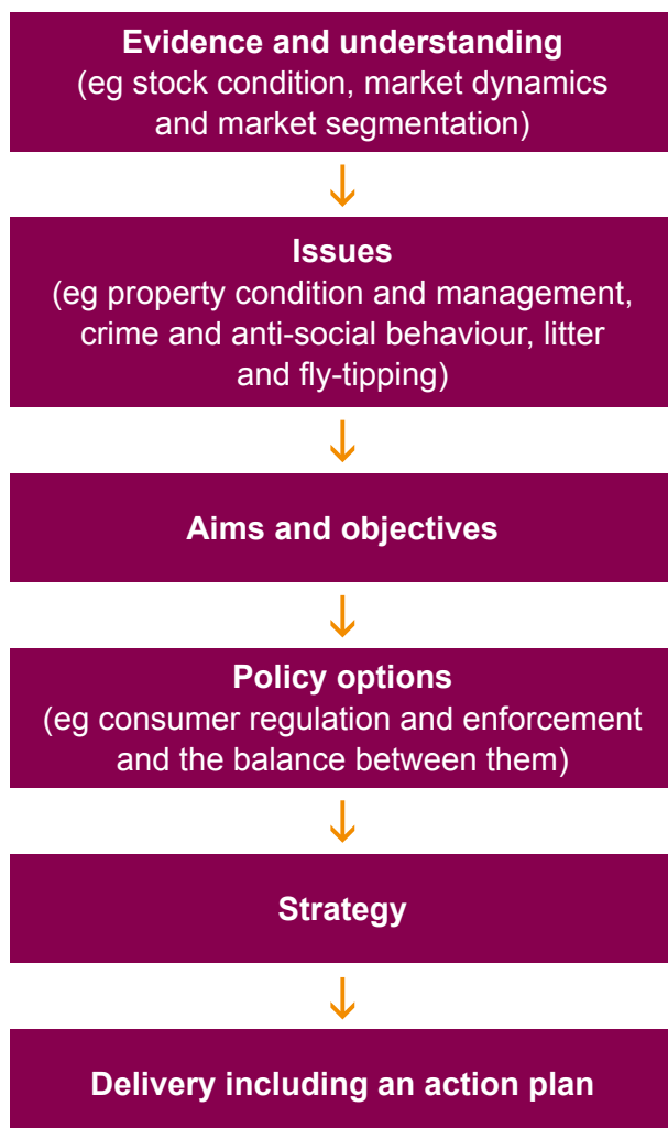
Diagram One: Policy making process

The toolkit includes checklist sub-sections on guidance on producing an evidence-base and developing a strategy. In relation to the former, its importance cannot be exaggerated. Effective policies and their implementation depend on an understanding of the dynamics of the sector. Proposals for selective licensing require that councils are able to justify their proposals with evidence of its appropriateness. There are significant resource implications.